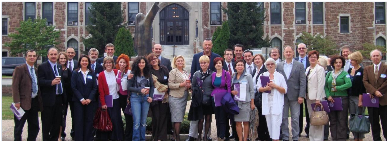
Members and guests at the 2011 Annual Meeting in St. Louis

Since the Academy founding in 2007, the strength and reach of our membership has continued to grow, as has the success of our annual meetings. The 2011 annual meeting, held in St. Louis, Missouri – now home to more than 50,000 members of the Bosnian-Herzegovinian Diaspora – provided us with a special opportunity to build bridges of relationship with younger Bosnians in one of the largest BiH immigrant communities in the United States.